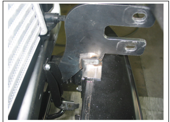
Figure 2: Passengers side mounting bracket in position