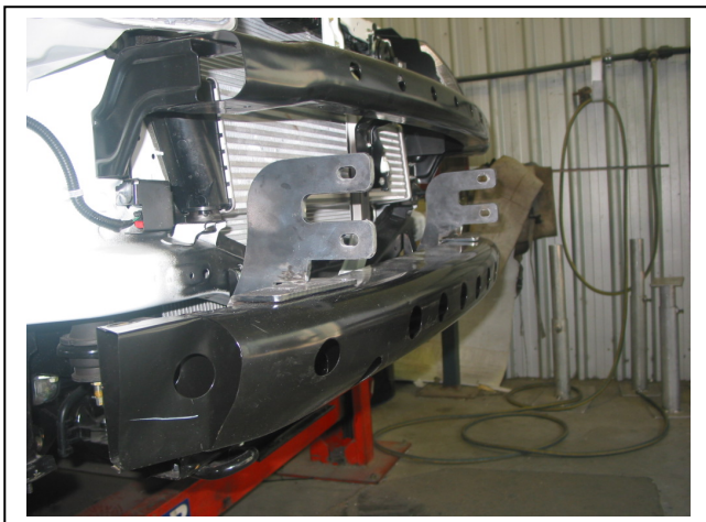
Figure 3: ECB steel mounting brackets fitted.