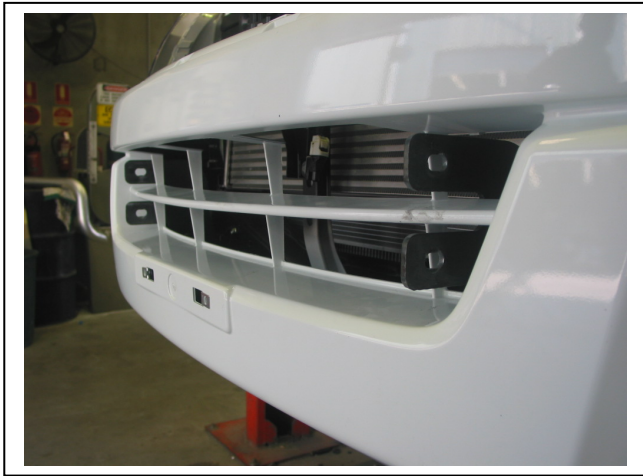
Figure 5: ECB steel mounts with bumper fitted.