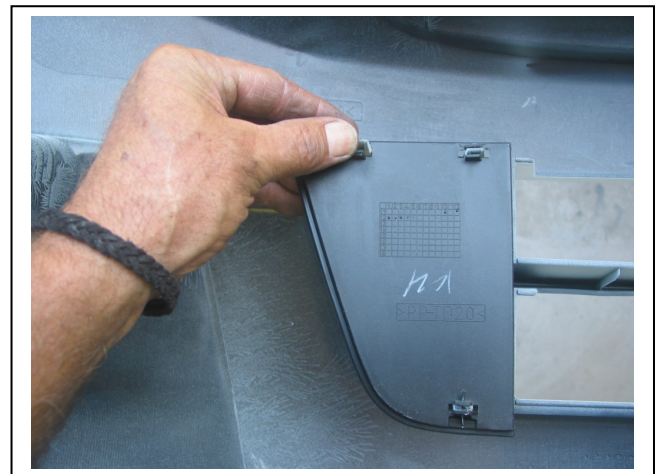
Figure 4: Remove passengers side blanking plate